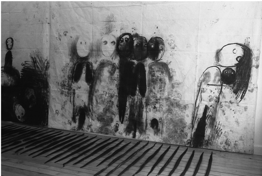
Miriam Cahn, DAS WILDE LIEBEN (frauenräume), état de guerre 1984, Installation view Serpentine Gallery London, Courtesy the artist and Meyer Riegger Berlin/Karlsruhe/Basel