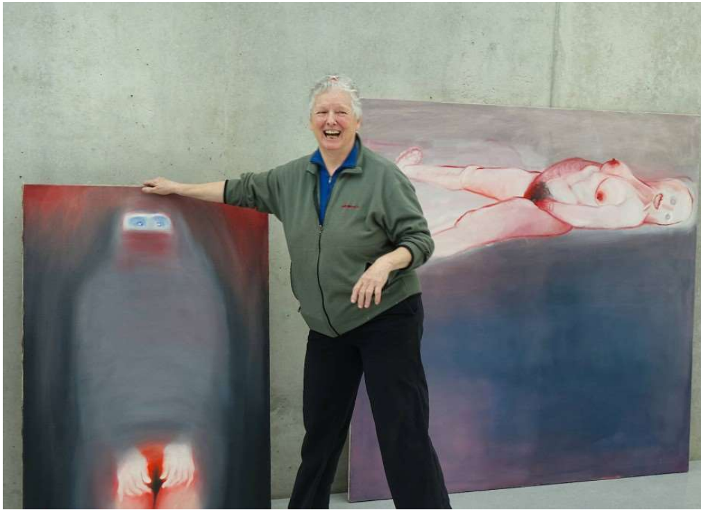
Miriam Cahn, 2019, Courtesy the artist and Kunsthau Bregenz