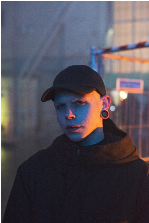
Tobias Zielony, from the series „Golden“, 2018, Courtesy the Artist and KOW, Berlin