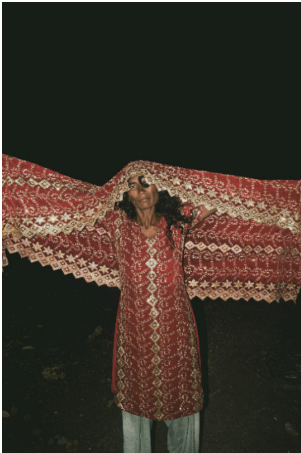
Soham Gupta, Untitled, from the series „Angst“ (2013-17), Collection Museum Folkwang Essen, Courtesy the artist