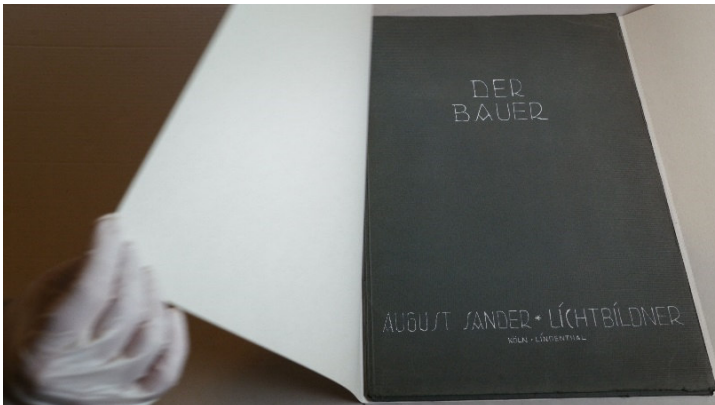
Sandra Schäfer, Westerwald: Eine Heimsuchung, 2021, Still