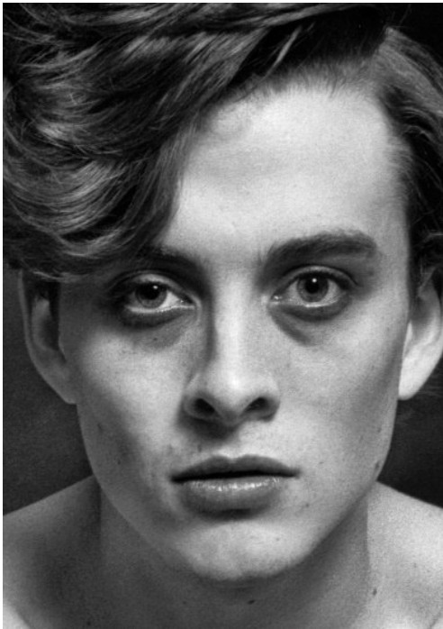
Collier Schorr, Wes Portrait , 2009–2018, Courtesy the artist, Modern Art, London and 303 Gallery, New York