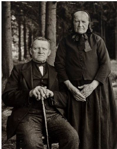
August Sander, Bauernpaar – Zucht und Harmonie, 1912, from: People of the 20th Century, Contemporary Collection MGKSiegen