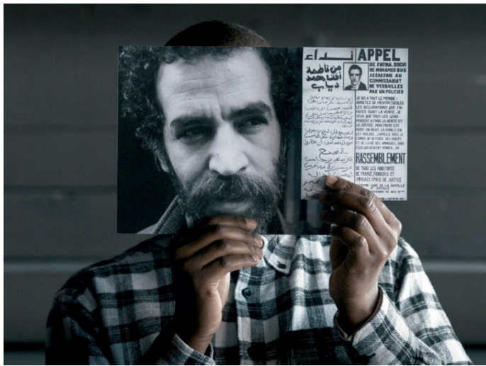
Bouchra Khalili, The Tempest Society , 2017, Still, Courtesy mor charpentier, Paris, © VG Bild-Kunst, Bonn 2022