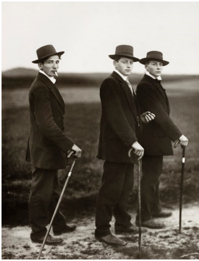
August Sander, Jungbauern, 1914, from: People of the 20th Century, Contemporary Collection MGKSiegen