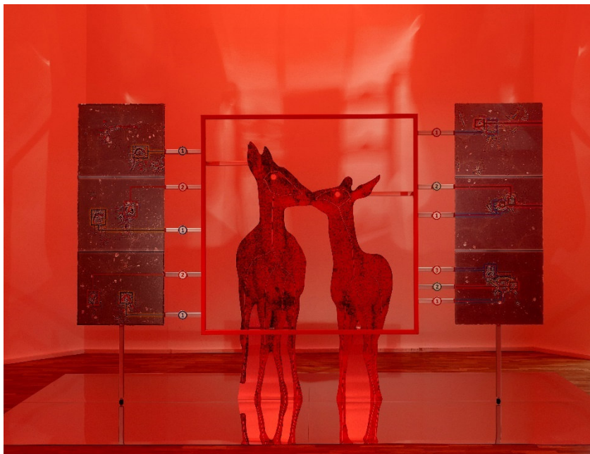
Katja Novitskova, Pattern of Activation (Deers Kissing, Vision Mode), 2023, Installation view MGKSiegen, Courtesy the artist and Kraupa-Tuskany Zeidler, Berlin, Photo: Philipp Ottendörfer