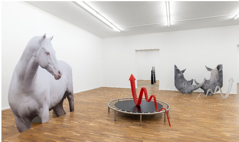
Katja Novitskova, Pattern of Activation , 2014, Pattern of Activation (rhinos) , 2014, Installation view MGKSiegen, Courtesy the artist, Boros Collection Berlin and Lewben Art Foundation, Photo: Philipp Ottendörfer