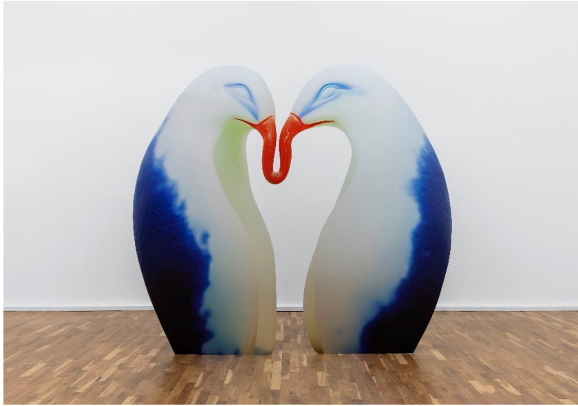
Katja Novitskova, Approximation (Looking Glass Birds of Paradise) , 2023, Installation view MGKSiegen, Courtesy the artist and Kraupa-Tuskany Zeidler, Berlin, Photo: Philipp Ottendörfer