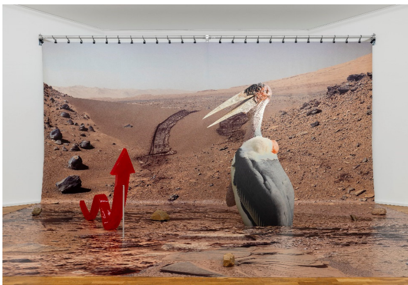
Katja Novitskova, Pattern of Activation (on Mars) , 2014, Installation view MGKSiegen, Courtesy the artist and Köser Collection, Cologne, Photo: Philipp Ottendörfer